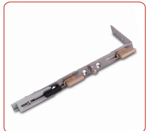
Corner Locking (PAS 024 Solution only)